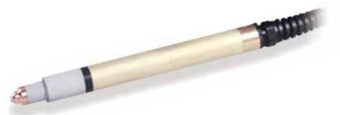
T100M machine torch