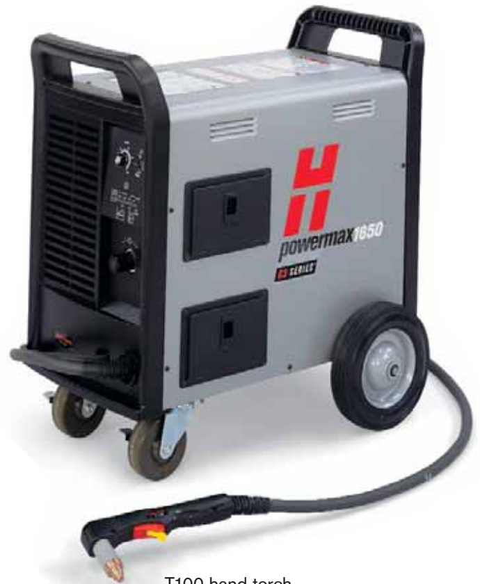
T100 hand torch